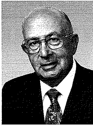
By Donald V. Victorson, CLU

Pap Tests are performed on normal women who exhibit no symptoms of cancer and have no indications of cancer. In the event of symptoms or indications of cancer a biopsy is usually performed to definitively rule out cancer or to diagnose a cancer.